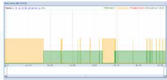
Vigilant status reports include two alert levels